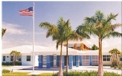
South Miami-Dade Center